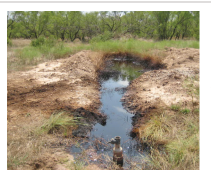
RRC capped this abandoned leaking well in Archer County earlier this year. In addition to plugging the well to stop the environmental threat, the released fluids were disposed of properly and the contaminated soil was remediated.