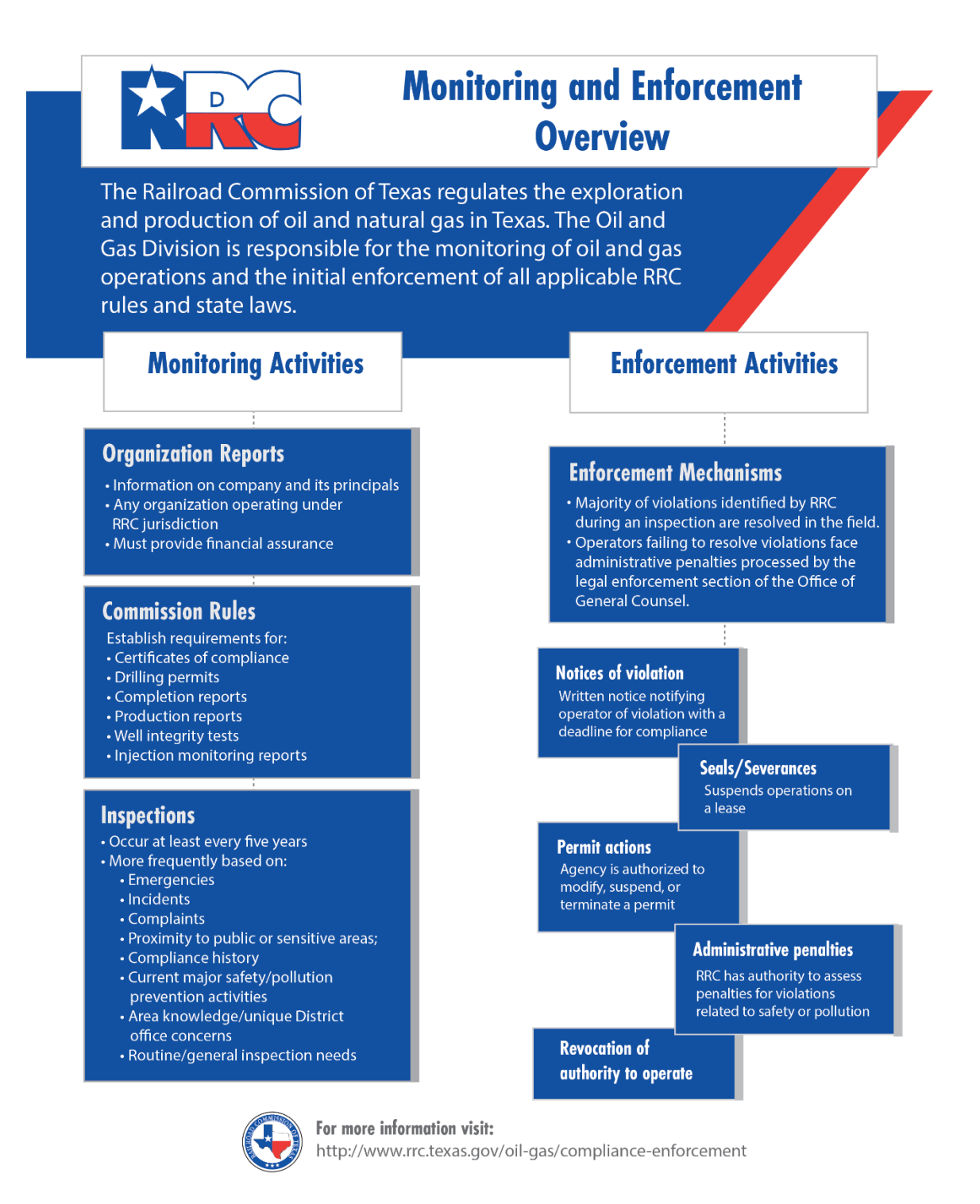
Figure 1: Monitoring and Enforcement Overview

tracking and reporting systems, which should provide data that can demonstrate the effectiveness of the Commission's monitoring and enforcement activities.